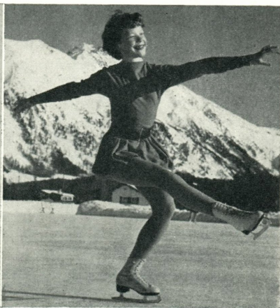
INA BAUER, GERMANY