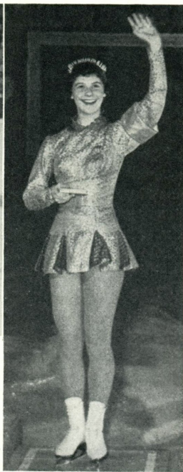
INGRID WENDL 1956 European and Austrian Champion