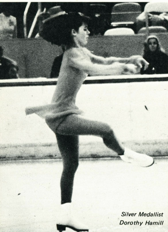
Silver Medallist Dorothy Hamill