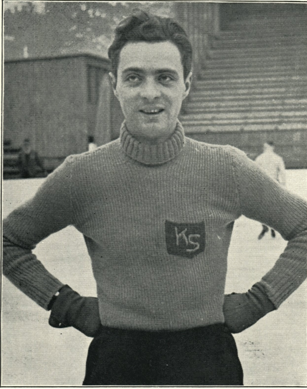
KARL SCHAFER Twice Olympic and Seven Times World's Champion