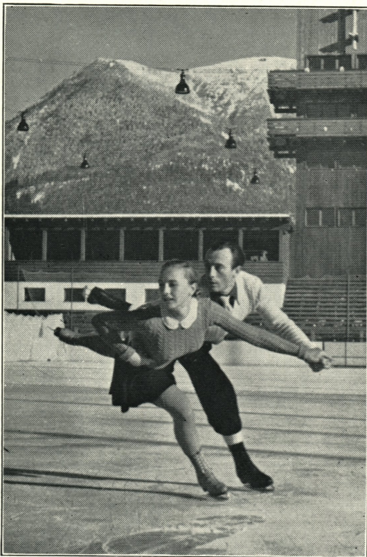
MAXI HERBER AND ERNST BAIER Olympic and World's Champions